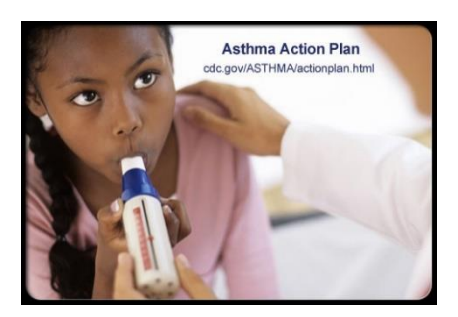
Follow Your Asthma Action Plan (cdc.gov/ASTHMA/actionplan.html)

An action plan tells you how to deal with symptoms of an asthma attack.